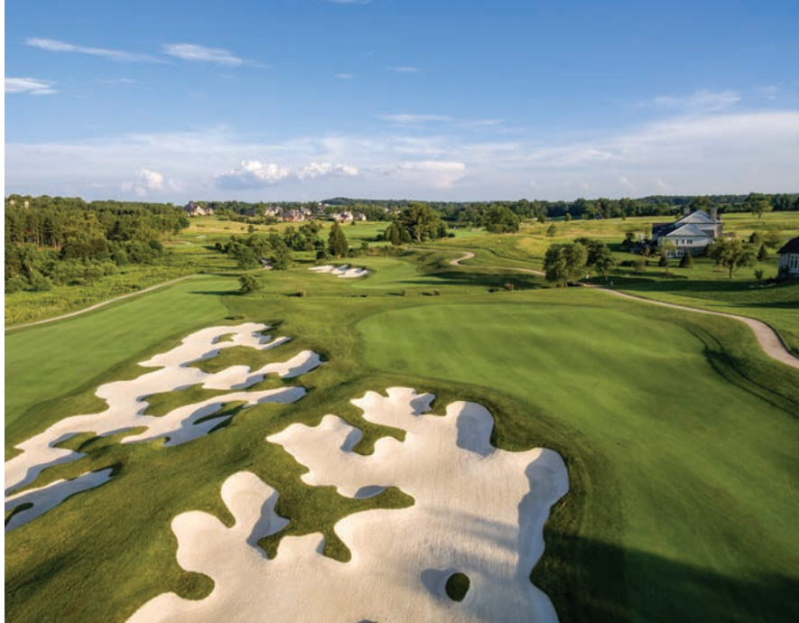
Creighton Farms makes the most of its rolling horse-country location. And its stunning Jack Nicklaus Signature Golf Course has played host to national championships. Plus, the season starts early here—a great benefit for visitors from the north.

And why wouldn’t they be? Willowbend has been one of the Bay State’s premier clubs for decades, with 27 holes of golf, extensive fitness and wellness facilities, superb dining—and tennis that includes the region’s only tennis stadium. While Renaissance has earned its place among the North Shore’s best private clubs with its spectacular golf course and long list of other amenities and family-friendly activities. But when you add to those the opportunity to stroll into any of Southworth’s other clubs