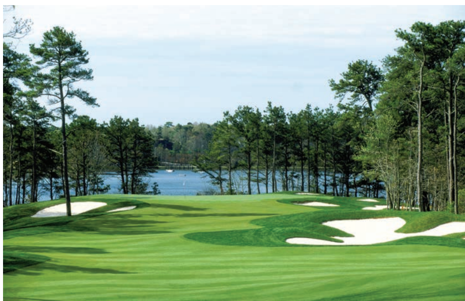
Willowbend on Cape Cod is Southworth's first property and home to an exclusive group of movers and shakers from the business, entertainment and professional worlds. The list of club amenities here is as long as a par five—as is its activities calendar.

Club at Creighton Farms makes the most of its scenic horse country setting. The club plays host each year to the Creighton Farms Invitational Hosted by Jack Nicklaus—on the course that Jack designed. But that's just one of the superb amenities that Southworth club members enjoy during visits, which include luxurious club rooms for overnight stays.