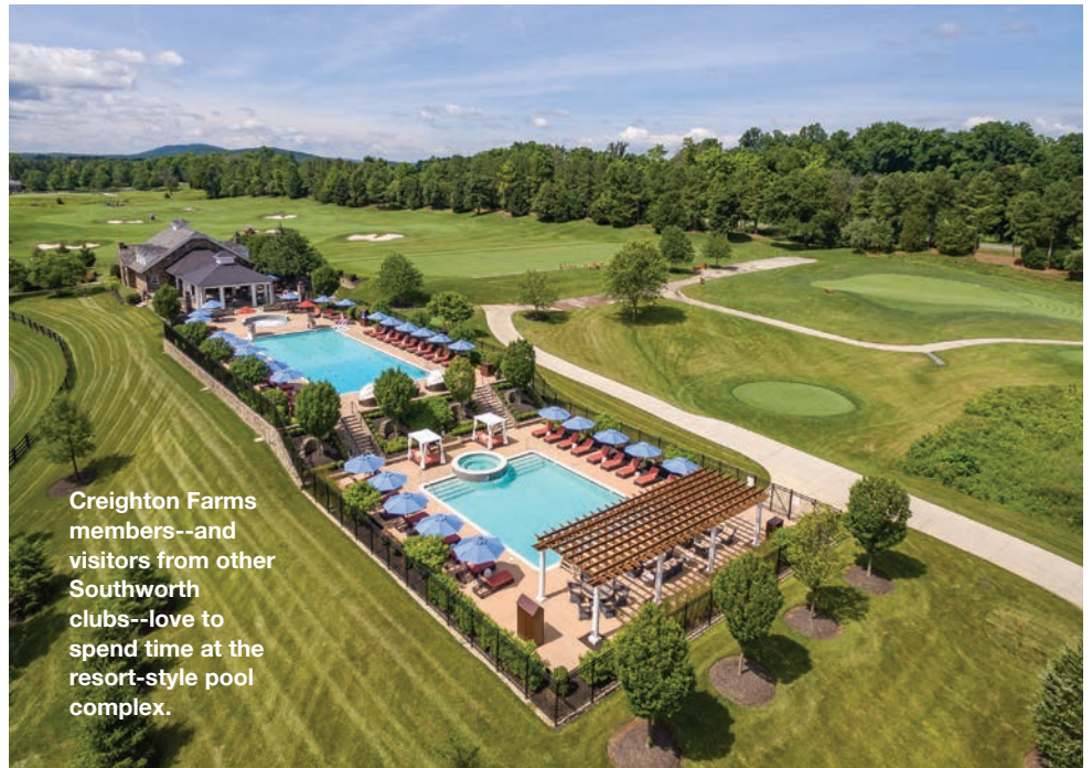
Creighton Farms members--and visitors from other Southworth clubs--love to spend time at the resort-style pool complex.

In Northern Virginia, just a few miles west of Washington, D.C., Southworth's