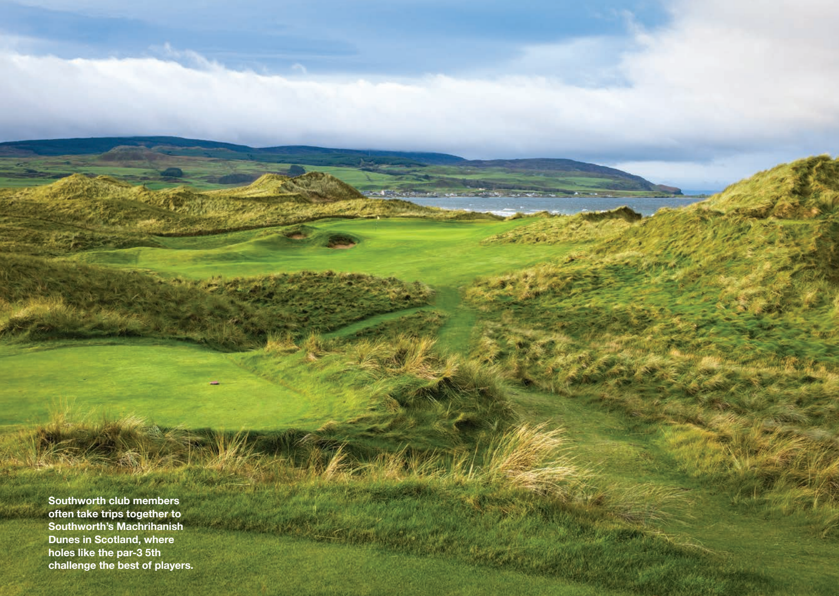
Southworth club members often take trips together to Southworth's Machrihanish Dunes in Scotland, where holes like the par-3 5th challenge the best of players.