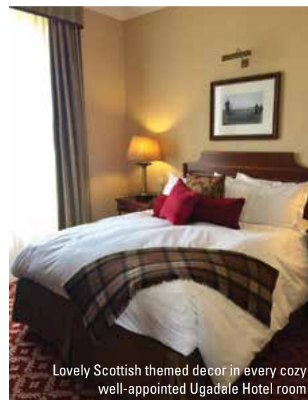
Lovely Scottish themed decor in every cozy well-appointed Ugadale Hotel room