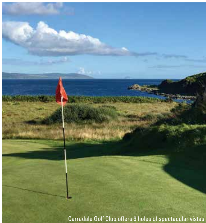
Carradale Golf Club offers 9 holes of spectacular vistas