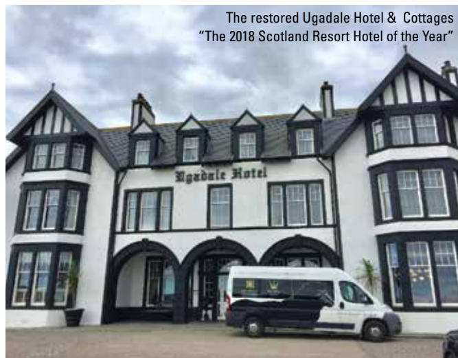
The restored Ugadale Hotel & Cottages "The 2018 Scotland Resort Hotel of the Year"