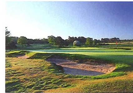
74 WALTON HEATH (NEW) FOWLER, 1907 / TADWORTH, SURREY / 7,175 YARDS, PAR 72

GREEN FEES: Mon-Fri £139 CONTACT: 01908 370756, www.woburn.co.uk/golf Bunker renovations have been undertaken on the Duke's - as it has elsewhere at Woburn - to ensure the hazards are of the very highest quality and as close to the original design as they can possibly be. To have two courses in the Top 100 and another in the Second 100 is a considerable achievement.