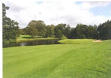
77 LITTLE ASTON VARDON, 1908 / STAFFORDSHIRE / 6,813 YARDS, PAR 72

■ A large, hidden bunker that made the second on the par-5 17th too exacting has been taken out. More visible marker poles have been installed. The 18th fairway has been moved to the right and the back of the green.