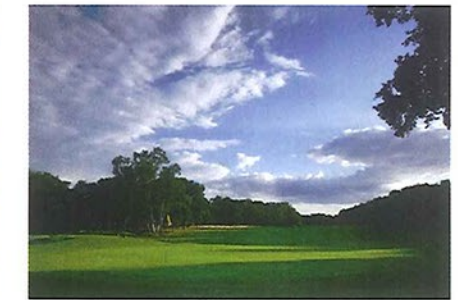
72 WENTWORTH (EAST) COLT, 1924 / VIRGINIA WATER, SURREY / 6,201 YARDS, PAR 68

GREEN FEES: Mon-Fri £75 (day ticket); Sat-Sun £80 CONTACT: 01728 453309, www.aldeburghgolfclub.co.uk A new tee has been reconstructed on the 4th and older bunkers have been brought up to the standard of the new ones. There is still plenty of gorse on every hole, but not quite as acutely intimidating as it used to be. There are now clever run-off areas around greens and the par remains very stingy.