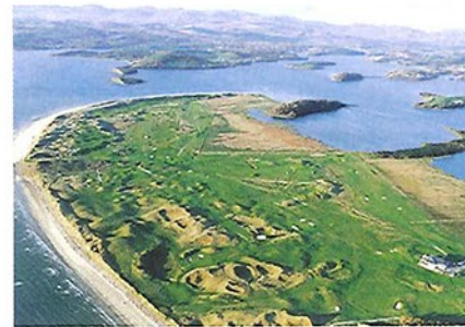
76 DONEGAL HACKETT, 1973 / COUNTY DONEGAL, IRELAND / 7,385 YARDS, PAR 73

GREEN FEE: £90 all week CONTACT: 0121 353 2942, www.littleastongolf.co.uk Though it's fallen since 2008, it is still one of just a few parklands to make the list. They've cleared trees and added bunkers on the 9th while on the next, tree thinning to the left carry allows views of the green and where drives finish. Scrub and tree thinning on the 5th allows sight of the whole green.