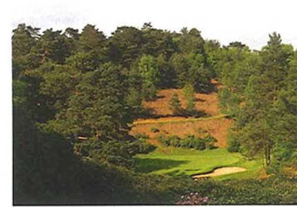
75 WOBURN (DUKE'S) LAWRIE, 1976 / WOBURN, BEDS / 6,976 YARDS, PAR 72

GREEN FEES: Mon-Fri €60; Sat-Sun €70 CONTACT: 00 353 7497 34054, www.donegalgolfclub.ie No significant changes to the course since Pat Ruddy directed upgrades to Eddie Hackett's design, with less of an emphasis on blind tee shots at this robust links on a peninsula in Donegal Bay. Off the tips it's an absolute beast, so choose your tees wisely; the par-3 5th, 'Valley of Tears', is awesome.